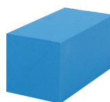
Blocco di riempimento RM